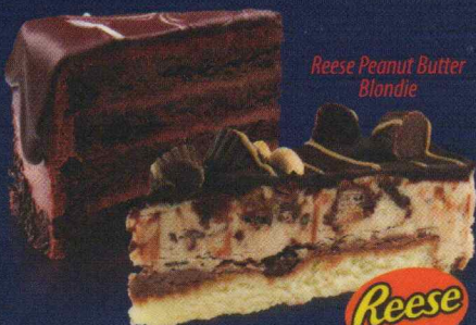
Reese Peanut Butter Blondie