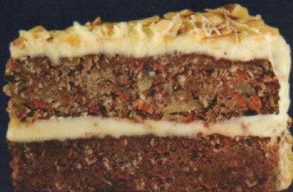
Decadent Carrot Cake

This gourmet version of the traditional carrot cake is loaded with carrots, pineapple, walnuts, coconut and spices, filled and covered with a rich cream cheese icing. We add the finishing touch with white chocolate drizzle and abundant toasted almond slices. $7.5