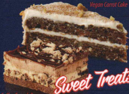
Coffee Crunch Bar